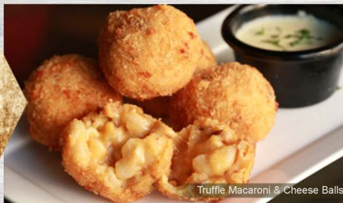
Truffle Macaroni & Cheese Balls

Crispy macaroni & cheese balls with fresh mushrooms and the flavors of exotic white truffles. Served with creamy Parmesan béchamel sauce for dipping. 365