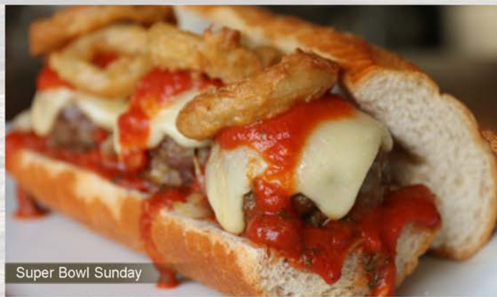
Super Bowl Sunday