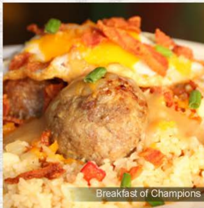
Breakfast of Champions

Try them all! One of each of our eight meatball flavors with your choice of any four sauces. Served with your choice of rice or spaghetti. Great for sharing! 695