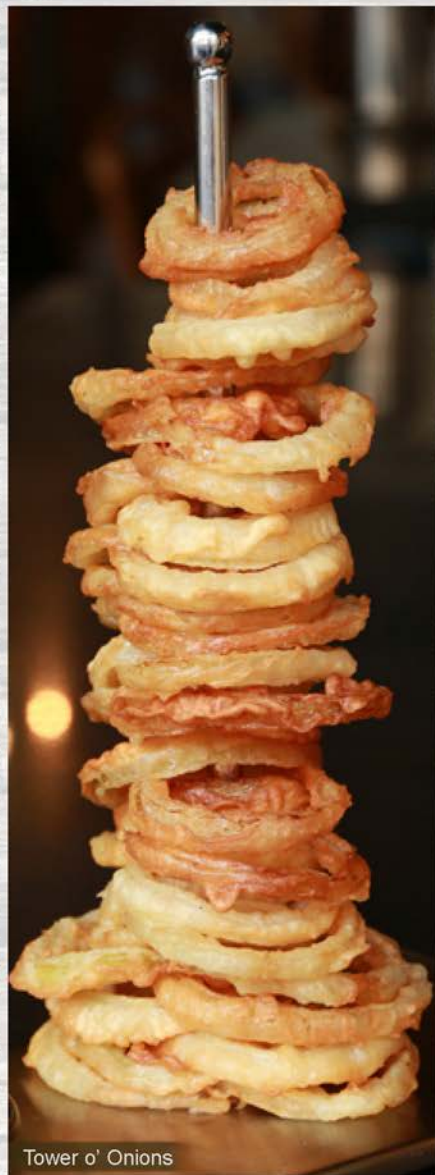
Tower o' Onions