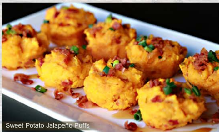
Sweet Potato Jalapeño Puffs

Bite-sized mini-muffins baked with fresh sweet potato and spicy jalapeños, topped with crispy bacon and served over a sweet maple glaze. 185