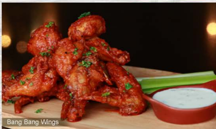
Bang Bang Wings

Sample our favorite appetizers! Sweet potato jalapeño puffs, crispy onion rings, bang bang wings and truffle macaroni & cheese balls served with three sauces for dipping. 410